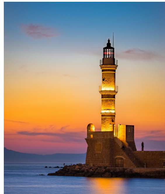
The lighthouse as an architectural monument.

LAST LIGHT proposes to reinterpret the lighthouse not as a machine, but as an inhabitable architectural experience: a place to arrive, to pause, to observe and to reflect. At the western edge of Europe, where land dissolves into the Atlantic Ocean, the lighthouse is no longer required to guide ships, but to offer meaning, presence and awareness. The project challenges participants to imagine a new lighthouse for our time — not as an instrument of navigation, but as a spatial device that connects humanity with landscape, light with silence, and architecture with the horizon itself.