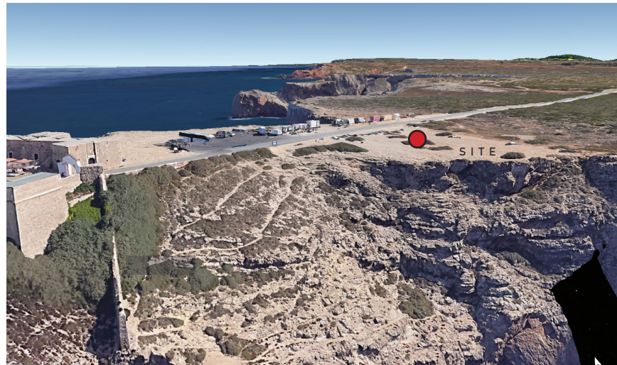
Cape of Saint Vincent, Sagres Point, Portugal