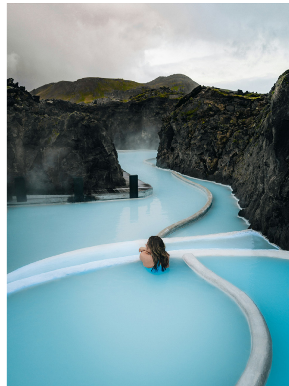
Blue Lagoon, main thermal baths in Iceland.

The combination of geothermal energy, unique landscapes, and a deep-rooted tradition linked to the use of hot springs makes Iceland an ideal location for developing architectural projects focused on contemplation and well-being in harmony with nature. In this exceptional environment, architecture has the opportunity to create memorable experiences where visitors can connect with the natural forces that have shaped the island for thousands of years.