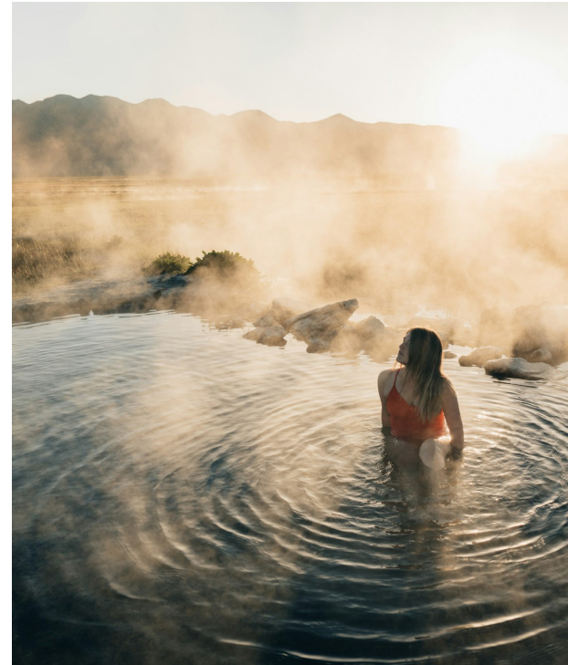
Natural thermal pool in Iceland.

The competition seeks innovative ideas capable of responding to Iceland’s unique climate, geology, and atmosphere, creating a sanctuary where architecture becomes a link between the visitor and the natural forces that have shaped this extraordinary landscape.