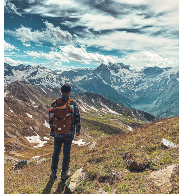
Travelers on the Swiss Alps journey.

It should be designed as a structure that can withstand the effects of time and is easy to maintain. The design should be integrated into the context, be low-impact, and prioritize the natural landscape at all times.