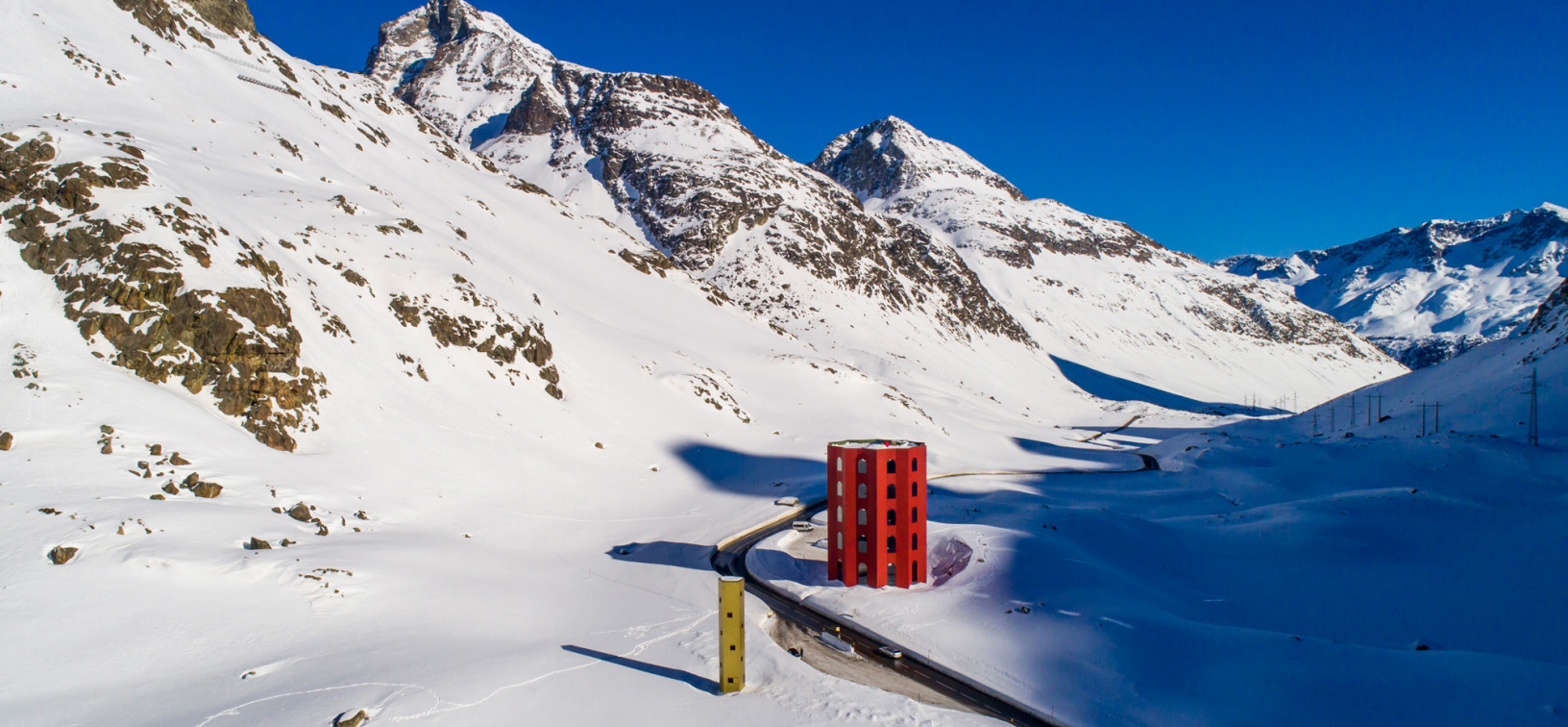
Juliertheater, a prominent theatrical structure, located on the Julier Pass.