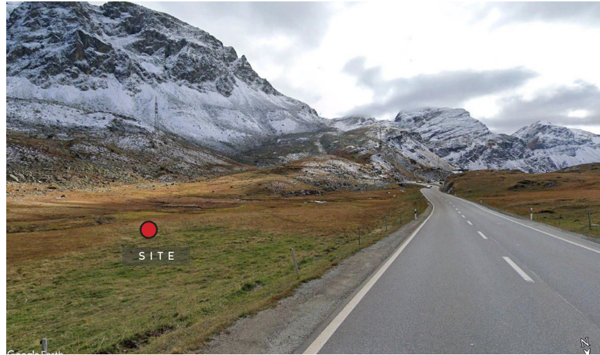
Julier Pass, Grisons, Switzerland